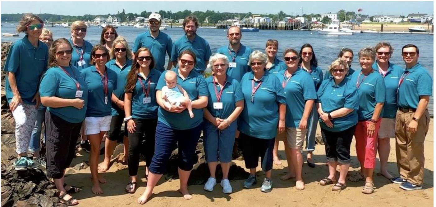
Happy group from 2019 Summer Teachers Institute above! “No matter where you are, It ALL starts with Agriculture!”